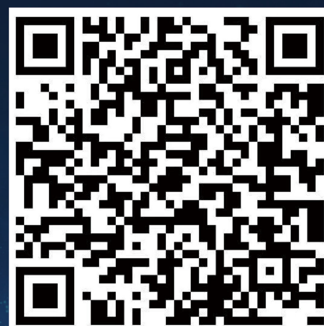
Winter school Wechat Group