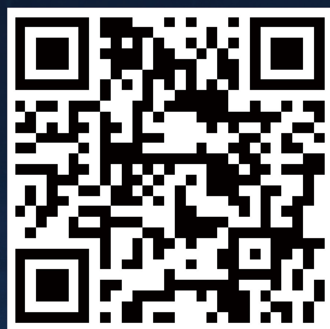
Winter school website

-For detail information, please scan the following Wechat