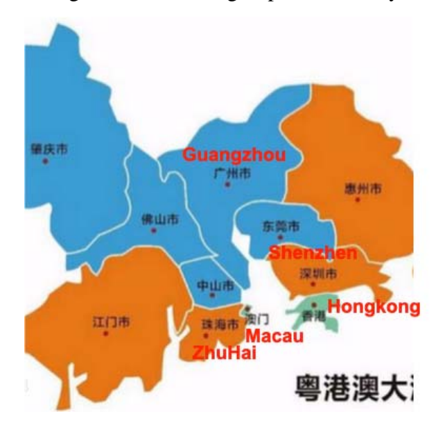
Fig. 2: Sun Yat-sen University locates at the Bay Area of China, we welcome new faculties member to join