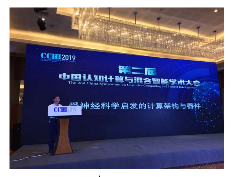
Fig. 4: Prof. Yu is invited to give a talk in the 2<sup>nd</sup> China Symposium on Cognitive and Hybrid Intelligence